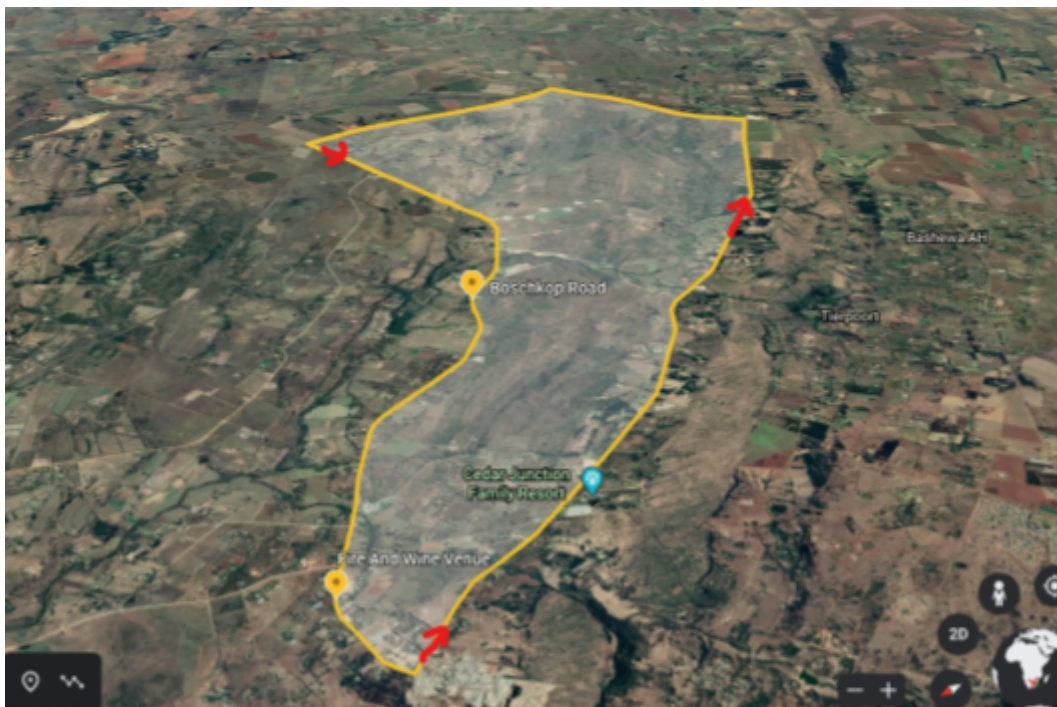
AERIAL VIEW OF ROUTE